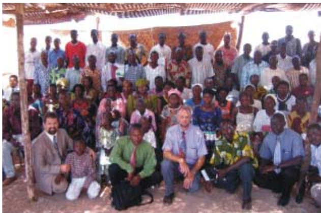
FIRST SERVICE IN OUAGADOUGO

Please continue to pray with us about the needs of the four pastors who are serving as missionaries in Ouaga. We have been trying to find land for the church but the prices in the city are very high. One building lot, about 80' x 80' is selling for $25,000. Lord willing after the first year of ministry we will divide the team into two parts and plant another church. Pray for us as we seek the Lord's leading as to the next city we will plant a church in. This year we hope to go a survey trip to Niamey, Niger in order to spy out the land for ministry.